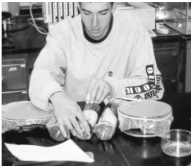
Student comparing carbon dioxide excretion in rats and turtles. Notice the proper use of replication which was determined by the student's laboratory group.

taught from within a rigidly defined curriculum, where all students were treated alike. The material provided in classroom or laboratory settings was content-based with structured lectures and readings from texts. The students were tested, in part, on their ability to reproduce certain facts on end-point exams. Finally, the previous education ideals dictated that the teacher worked alone and was an authority figure, so that students seldom disagreed with the instructor out of fear or embarrassment (i.e., the "Sage on the Stage" model of instruction).